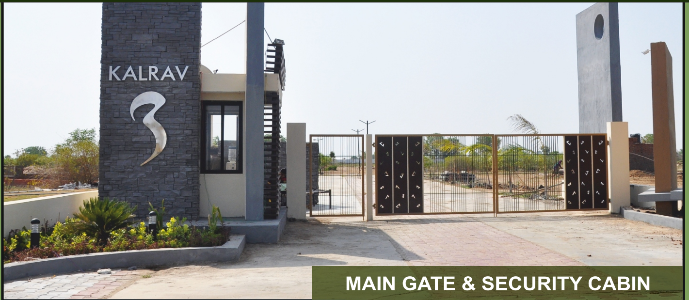
MAIN GATE & SECURITY CABIN